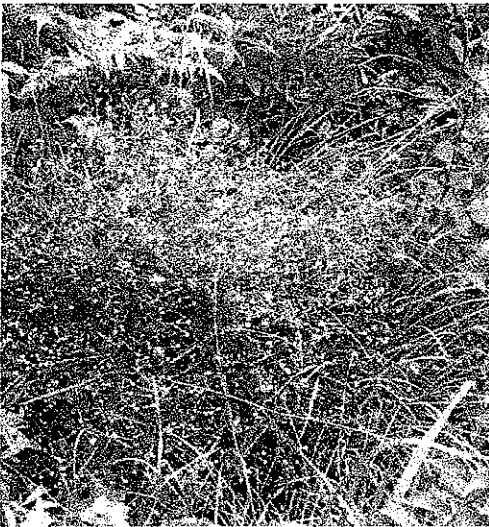
Yellow Wild Indigo

On June 11, 2011, we closed on the last three of a group of 39 vacant lots in the Willow Estates Subdivision in northeast Iroquois County plus one 4.5 acre lot nearby in Kankakee County, for which we had received a grant of nearly $80,000. The deadline for that grant was October, 2012, so we were well ahead of schedule. In the meantime, 22 more lots came on the market. Two of those were priced well beyond the appraised value, so we crossed them off our list. We submitted a proposal for another grant to cover 70% of the cost of the remaining lots; the Friends have to provide 30% matching funds. To insure that the Board of the Illinois Clean Energy Community Foundation, the granting agency, was aware that we had completed the acquisitions covered in the existing grant, we gathered the necessary paperwork and wrote a final report for the completion of the 40 purchases covered by the 2010 grant.