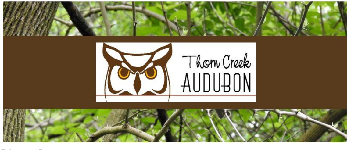
February 15, 2024

News: Woodcock Walk, Plant Order Deadline Is March 1, and More From:Thorn Creek Audubon<horncreekaudubon@gmail.com>